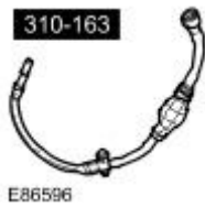
310-163 Bleeder, Fuel System